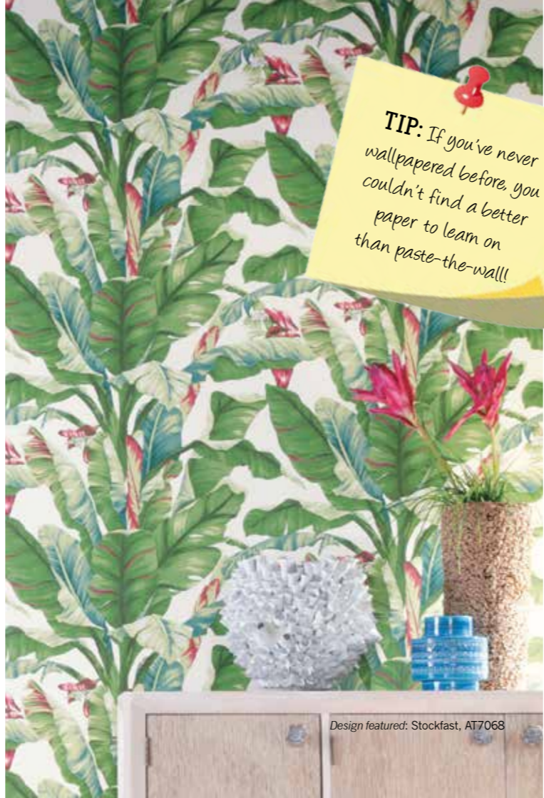
Design featured: Stockfast, AT7068