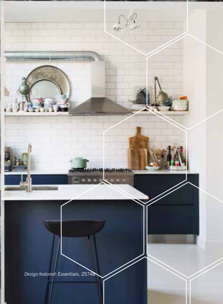
Design featured: Essentials, 25748

TIP: Use Metylan Active Wallpaper Remover to make removing the old paper easy